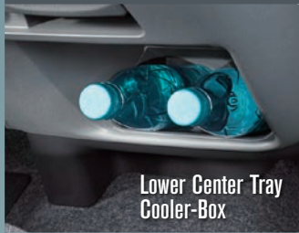
Lower Center Tray Cooler-Box